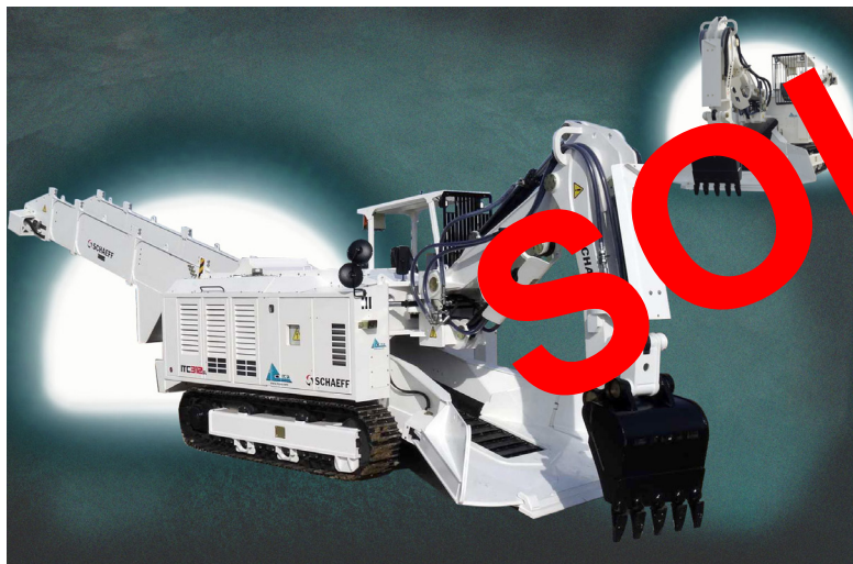
Non contractual picture