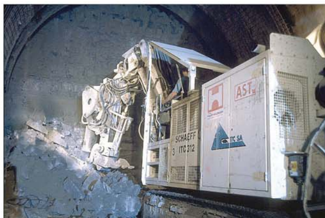
Hammer operation in the hard limestone