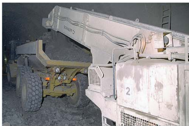
Loading 25t articulated dump trucks