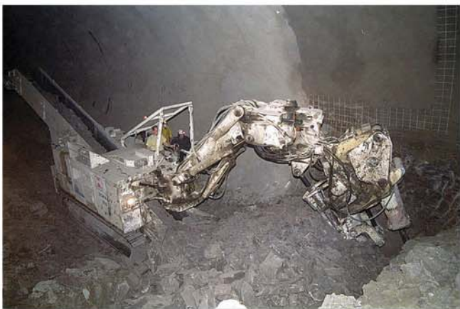
Heading and loading in schluff with the bucket