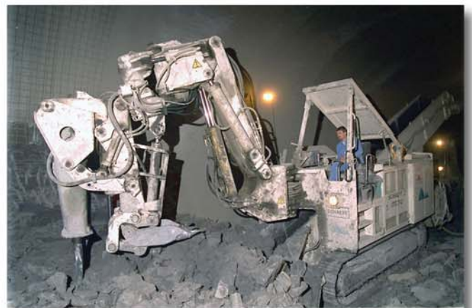
Heading in the hard limestone with the integrated Hammer