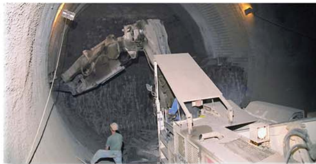
Accurate excavation thanks to the tilt and swivel console