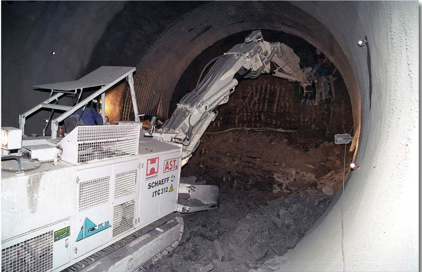
The Tunnel Heading and Loading Machine Schaeff model ITC 312 N1s excavating the fullround cross-section \varnothing 8,6 m