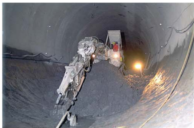
Lowering resp. cleaning the invert