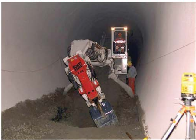
Accurate excavation thanks to the tilt and swivel console