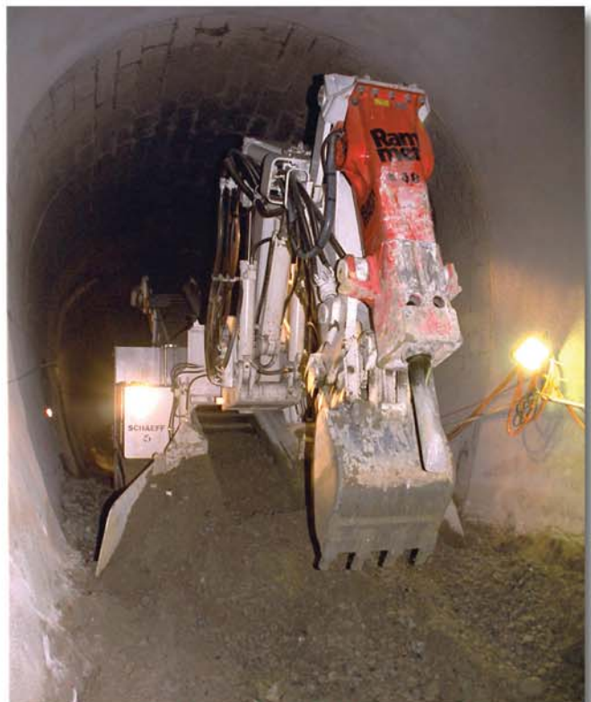
... hammer and bucket, exchanged in few seconds