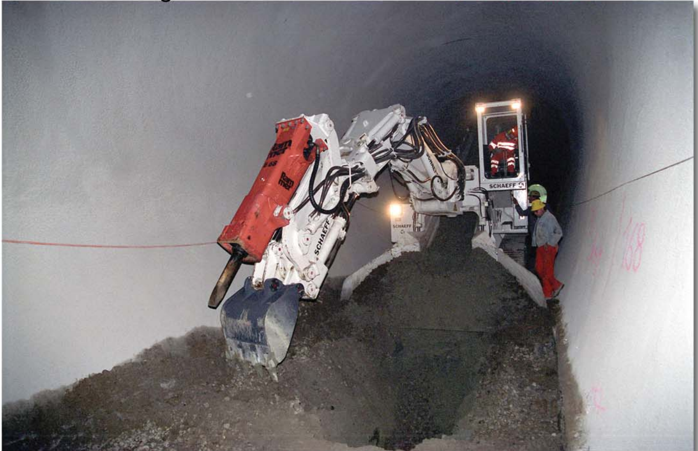
The Heading and Loading Machine Schaeff model ITC 420 excavation of the invert with the bucket