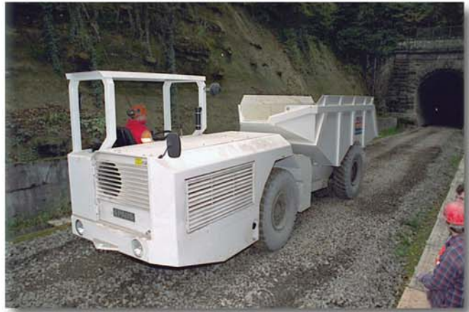
Material transport with the articulated dump truck Paus model ITC 8000