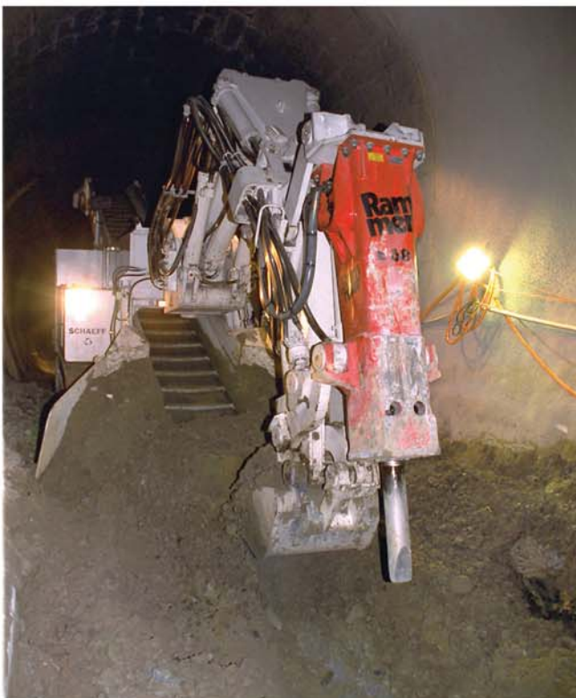
The Tunnel Heading Machine Schaeff model ITC 420 ....