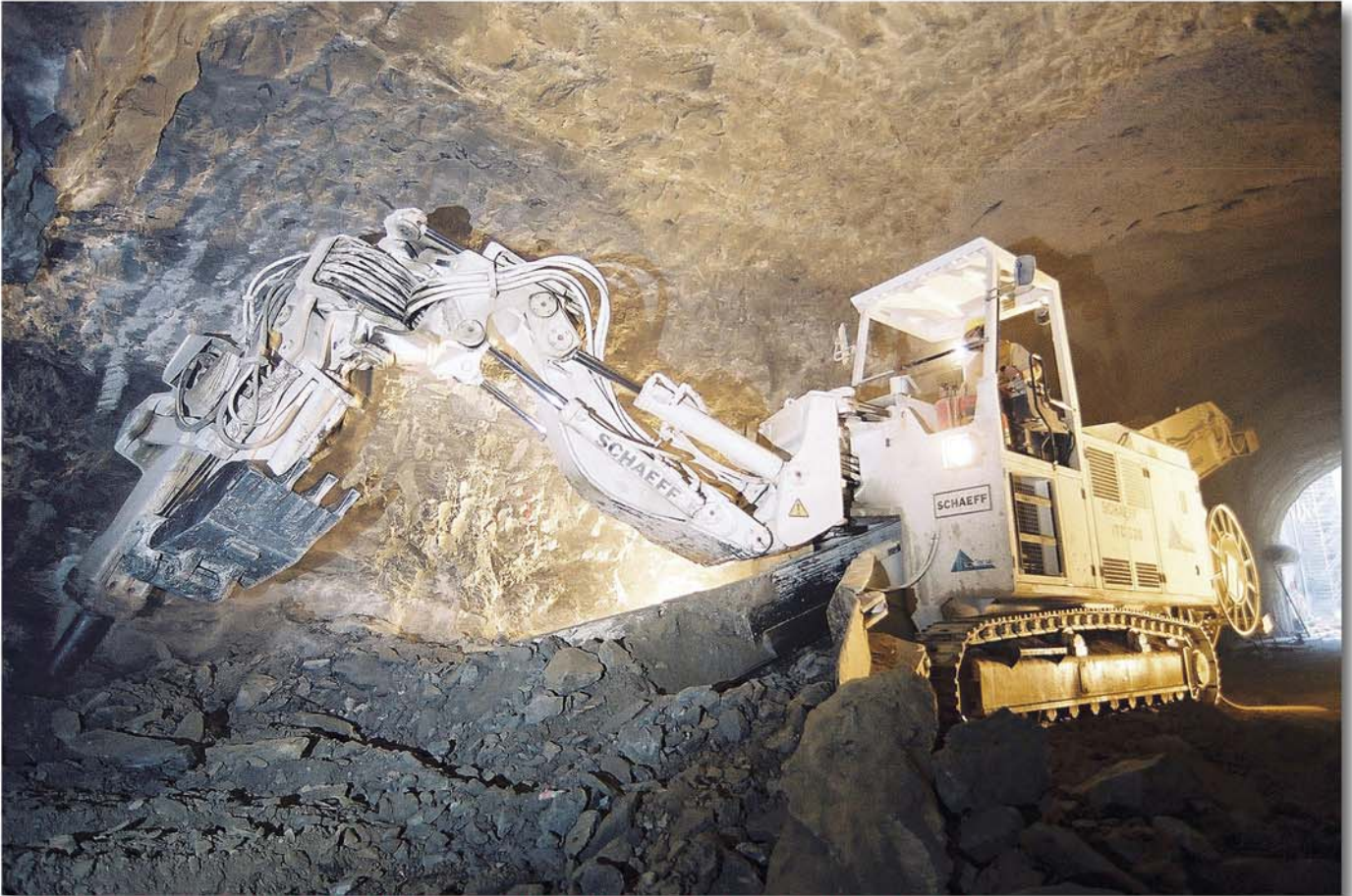
The Heading and Loading Machine Schaeff model ITC 320 producing big blocks and few dust