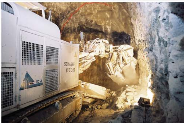
Acurate operation thanks tilt and swivel console