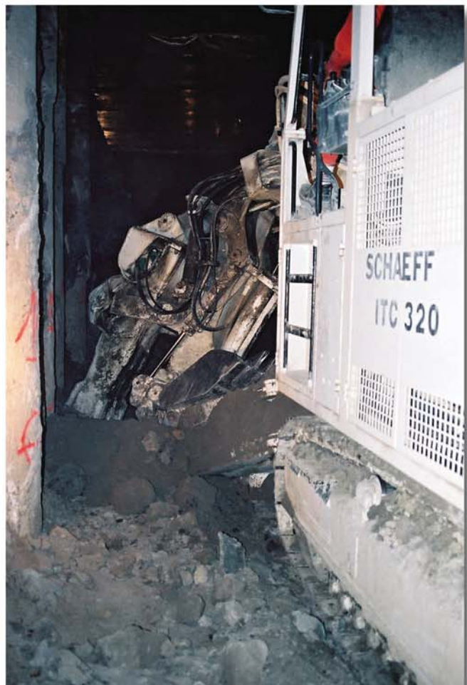
Cleaning the place for the steel arch