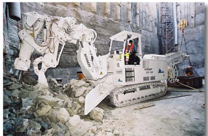
Loading onto crane skips