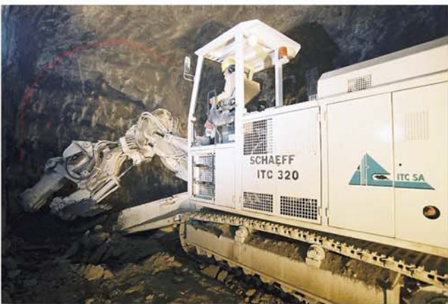
Profiling the lifters with the integrated hammer