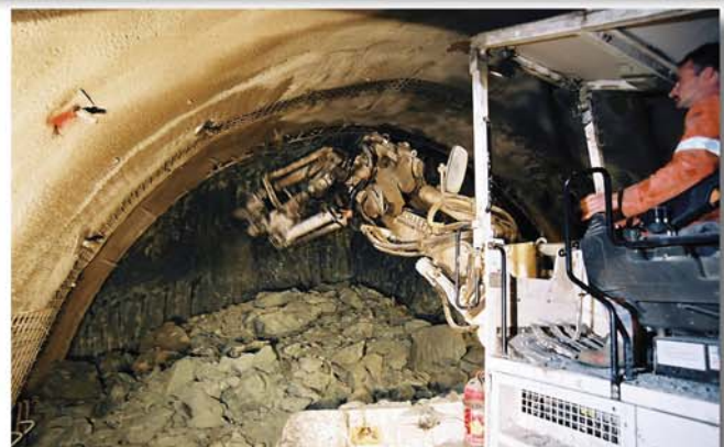
Acurate excavation thanks to the swivel and tilt console