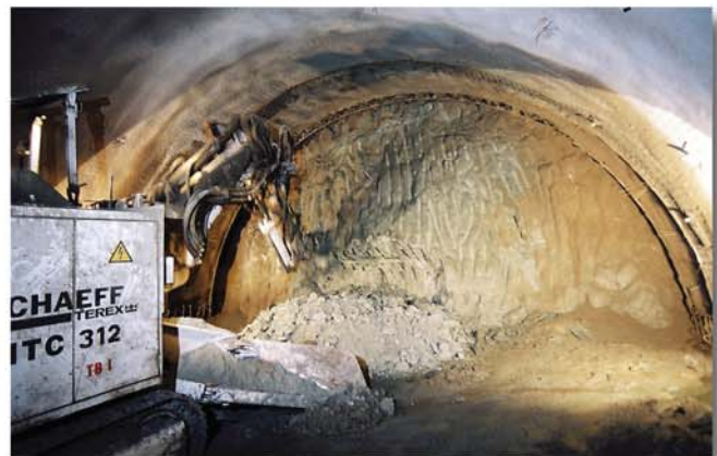
Excavation of the left vault part