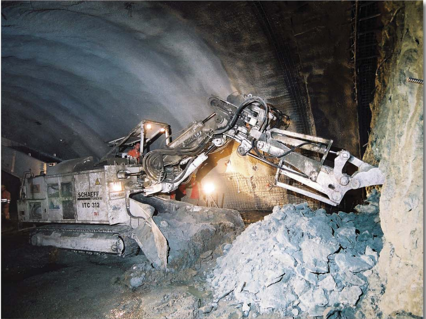
Vault heading in hard layers of Schlufton