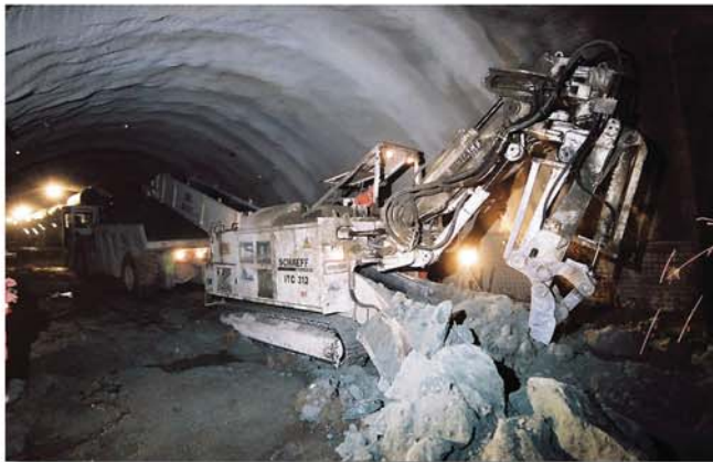
Quick loading cycle onto 30 to- dump trucks