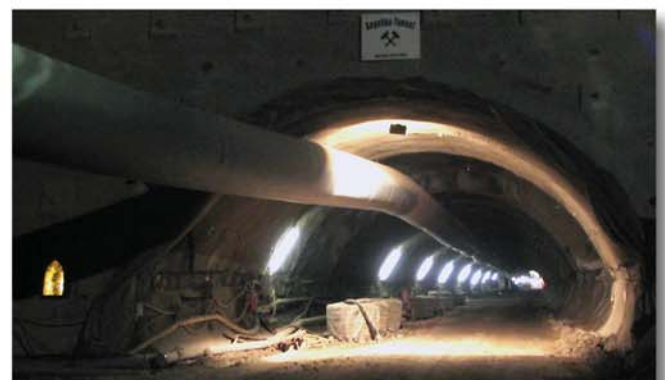
East entrance: Angelika-Tunnel, left the protective Barbara