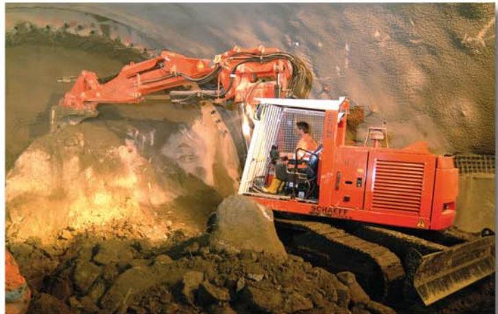
The Tunnel Excavator in working position