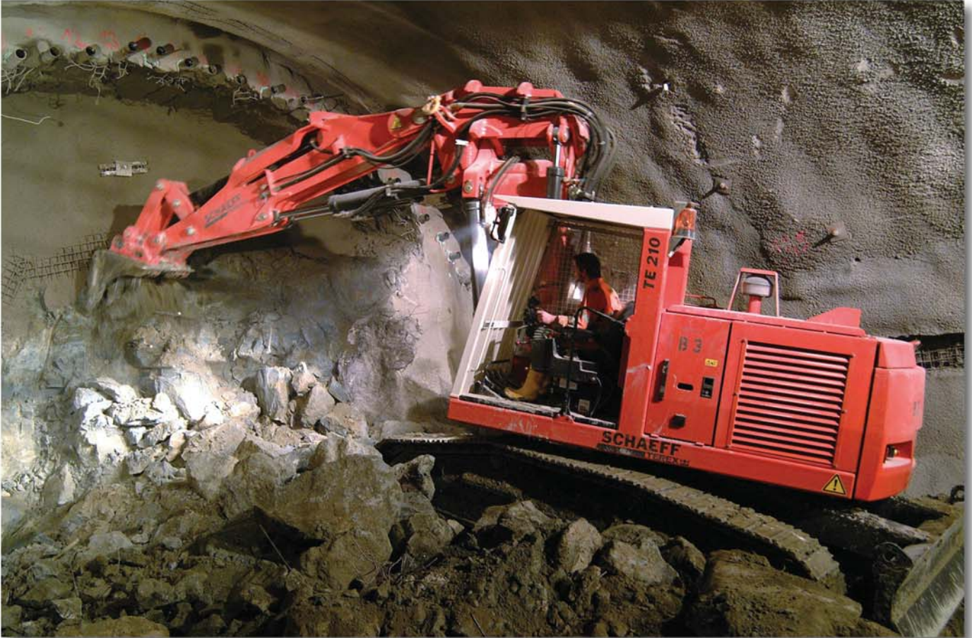
The Tunnel excavator model TE 210 in the 37 m 2 cross-section, crown height 6 m