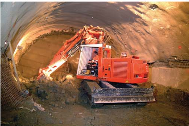
The Tunnel excavator model TE 200 climbing on the muck pile to excavate the crown