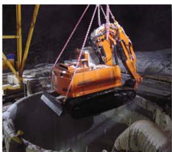
The Tunnel Excavator being lowered in the shaft