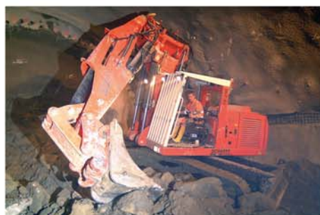
The Tunnel Excavator