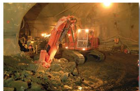
The Tunnel Excavator