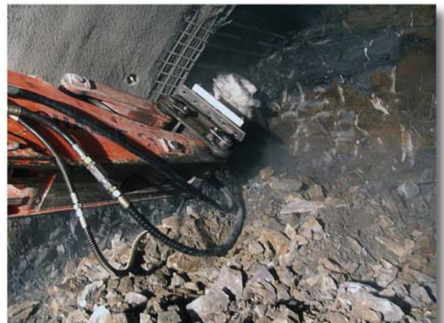
Left side drift: the Schaeff Tunnel Excavator TE 200 while profiling the vault with a cutting unit

The east heading takes place by means of new Austrian tunnel construction method (NATM), i.e. via excavator and heading by blasting. At 1.8 km of twin lane single tunnel follows about 400 m of a long expansion range for the transition to the two single-railed tunnel tubes.