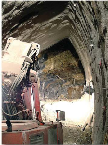
Right side drift: the Schaeff-Tunnel Excavator TE 200 while excavating the bench