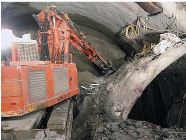
Top heading: the Schaeff-Tunnel Excavator TE 200 with swivel dipper stick