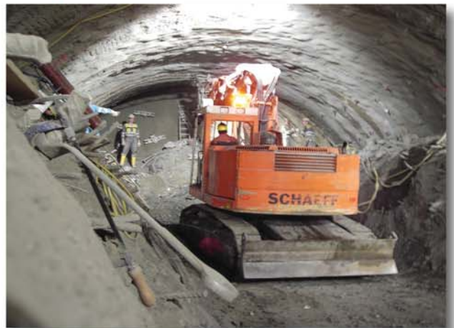
Top heading: the Schaeff Tunnel Excavator TE 200 while setting steel arches