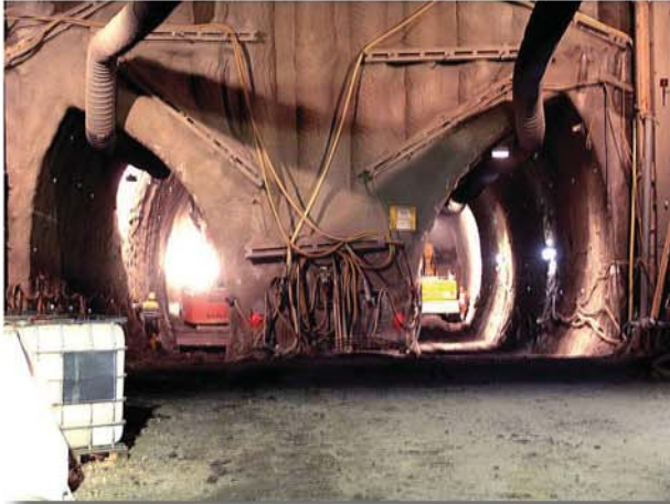
Both side drifts: left the Schaeff Tunnel Excavator TE 200

The Viennese forest tunnel runs on a length of about 13.35 km von Hadersdorf-Weidlingau in the east until Chorherren in the west. The Viennese forest tunnel is headed both conventionally and machinally (TBM).