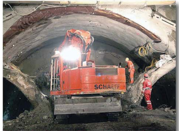
Top heading: the Schaeff Tunnel Excavator TE 200 during excavation