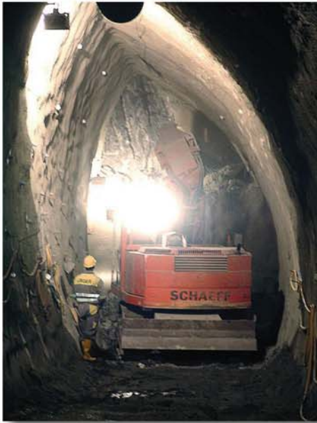
Left side drift: the Schaeff-Tunnel Excavator TE 200 while excavating the fore polling top heading