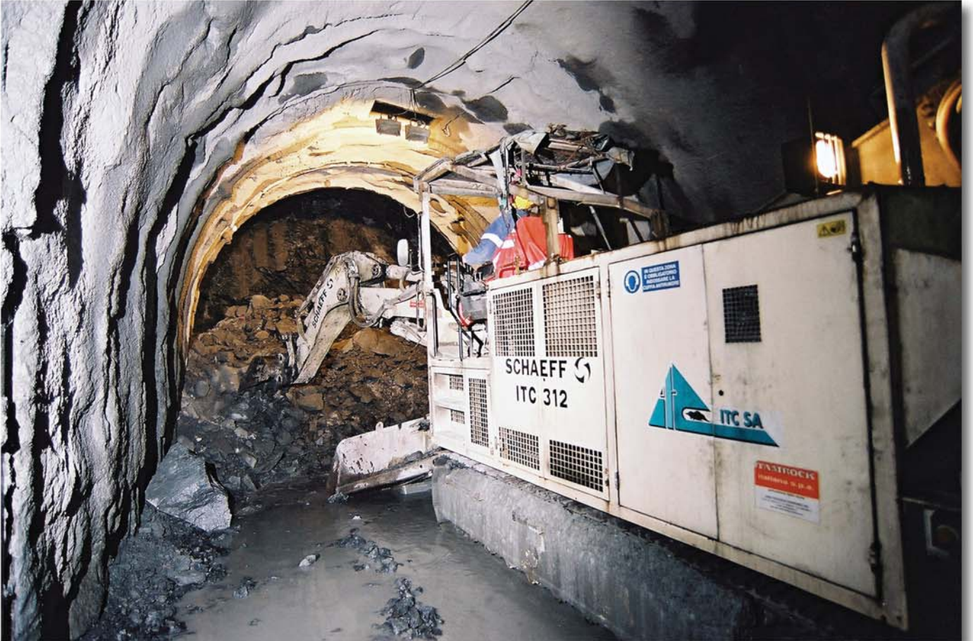
The Mucking machine Schaeff model ITC 312 H3 in loading position