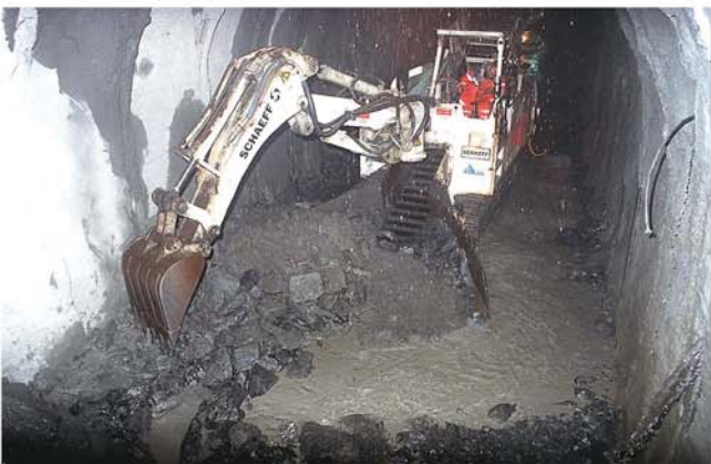
The Mucking machine Schaeff model ITC 312 H3 while cleaning the invert