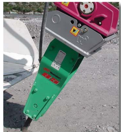
Quick hitch device with hammer for scaling