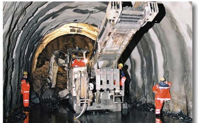
Difficult working condition in water