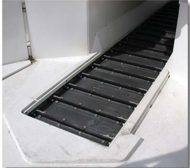
High capacity rubber plated conveyor