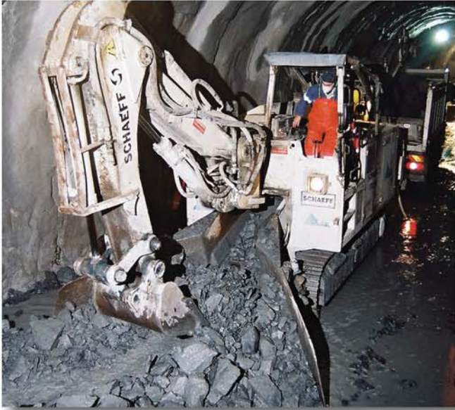
Loading onto 4 axles road lorry